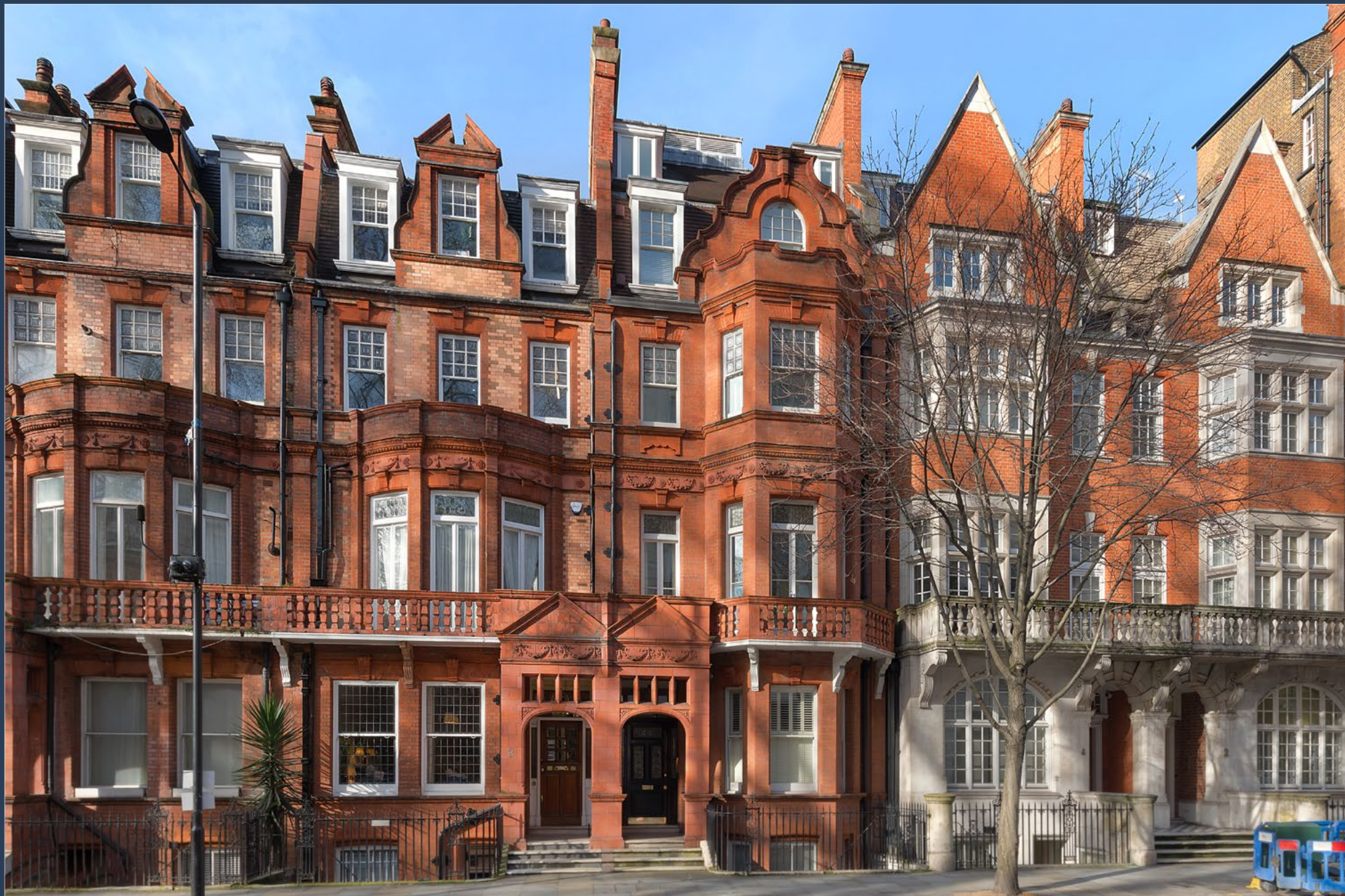
FLAT 1 • 6 LOWER SLOANE STREET • CHELSEA SW1 8BJ