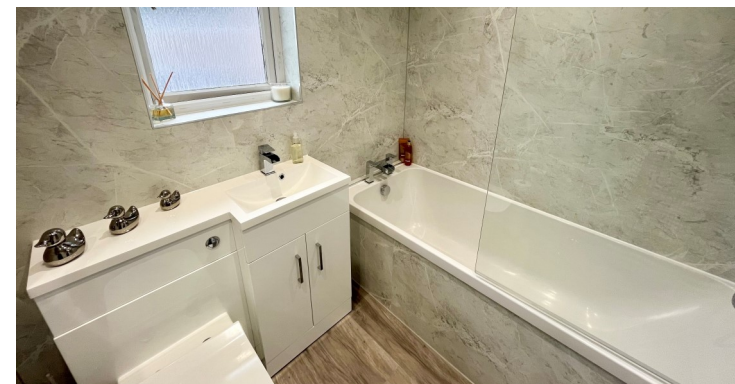
32 Livingstone Drive