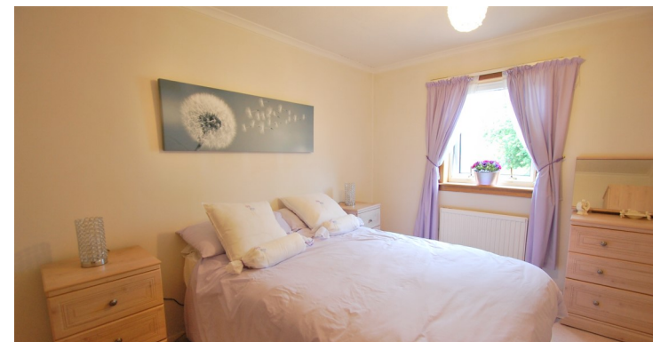
32 Liddle Drive