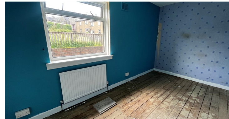
3 Providence Brae