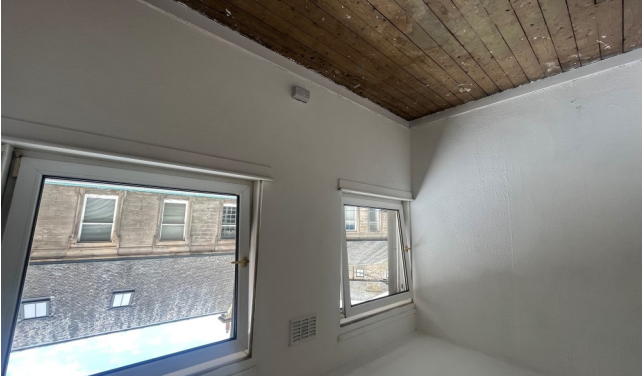
3 Providence Brae