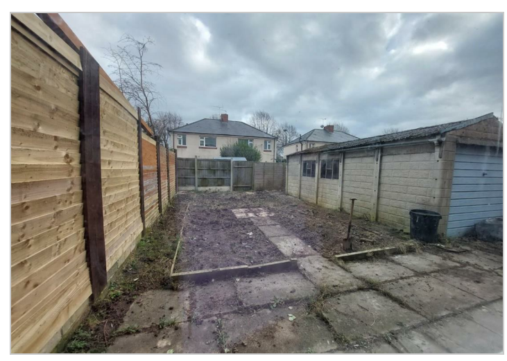
These particulars, whilst believed to be accurate are set out as a general outline only for guidance and do not constitute any part of an offer or contract. Intending purchasers should not rely on them as statements of representation of fact, but must satisfy themselves by inspection or otherwise as to their accuracy. No person in this firms employment has the authority to make or give any representation or warranty in respect of the property.