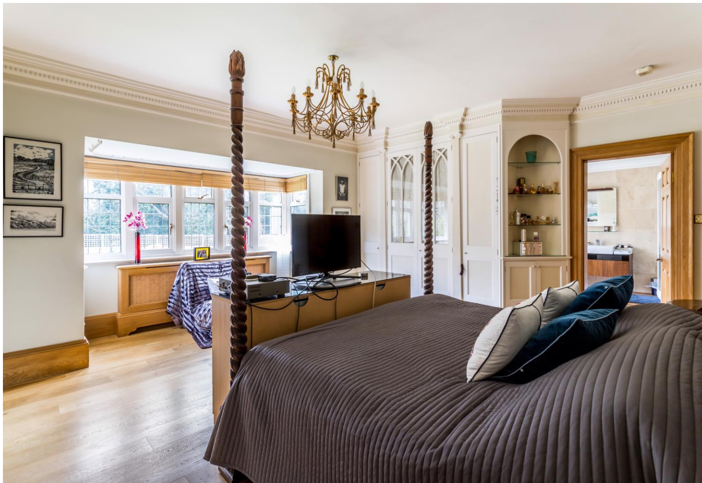
Bedroom 1 22' 10" x 18' 4" (6.95m x 5.58m) Rear aspect, large bay window, fitted wardrobes and dressing area, solid wood strip flooring, ornate cornice.