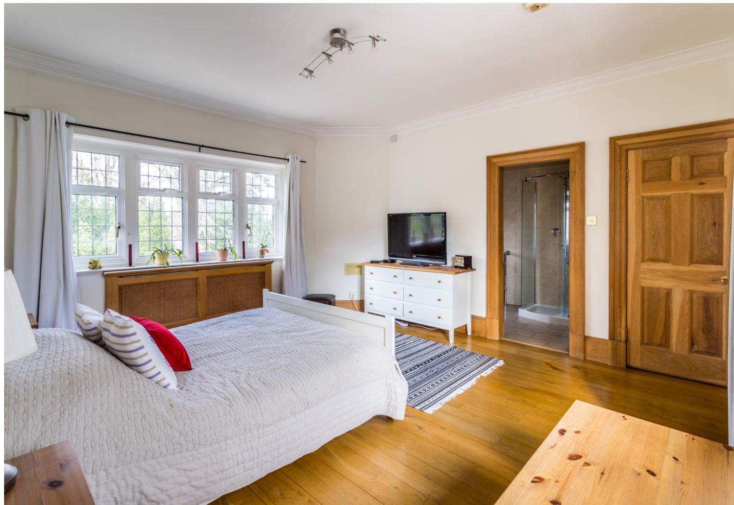
Bedroom 4 14' 9" x 14' 1" (4.49m x 4.29m) Double aspect.