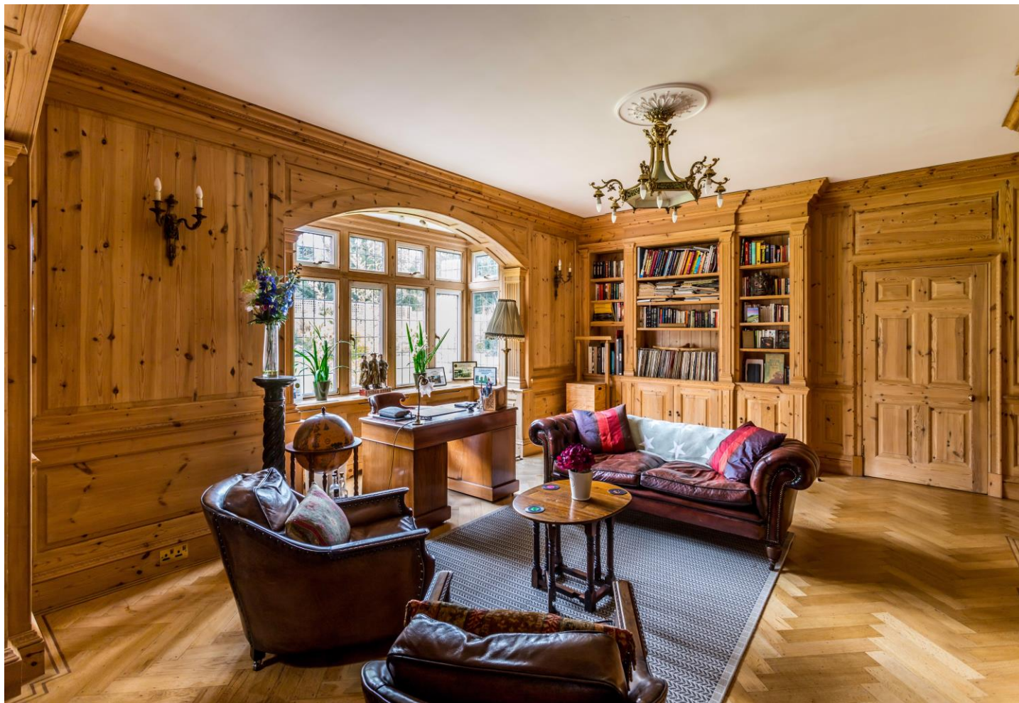
Library 21' 5" x 18' 5" (6.52m x 5.61m) Double aspect, large bay window, feature fireplace, solid wood herringbone style flooring, built-in bookcases.