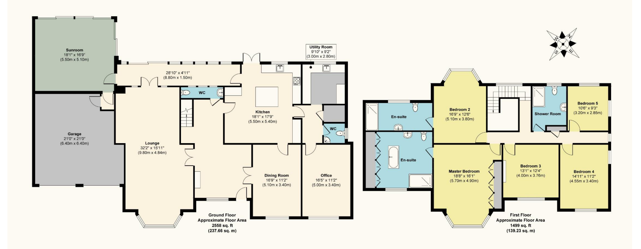
Approx. Gross Internal Floor Area 4057 sq. ft / 376.89 sq. m (Including Garage) Approx. Gross Internal Garage Area 394 sq. ft / 36.60 sq. m

Illustration for identification purposes only, measurements are approximate, not to scale.