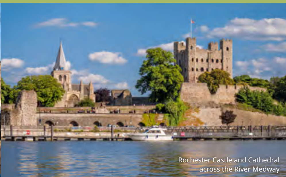
Rochester Castle and Cathedral across the River Medway