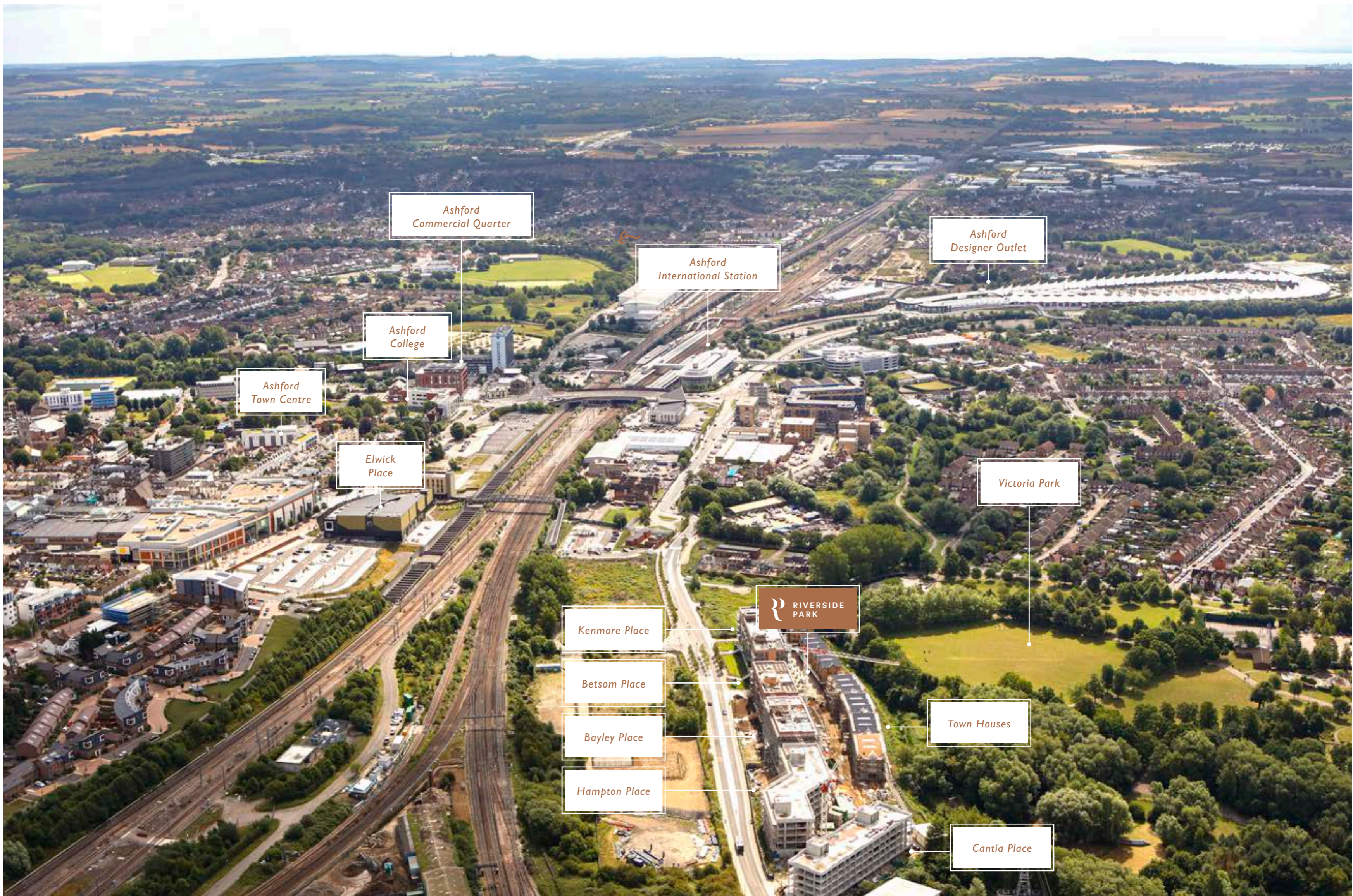
Computer generated image of Riverside Park. This aerial image was produced in 2017, since then a number of developments that were under construction at the time are now complete.