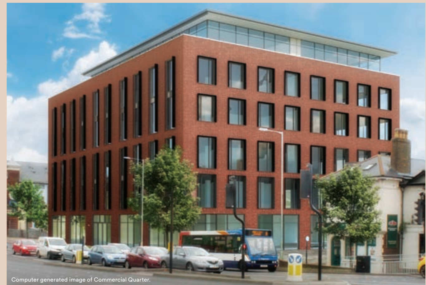
Computer generated image of Commercial Quarter.

Curious Brewery in 2019. The Brewery includes a range of visitor facilities, further drawing people into the town centre.