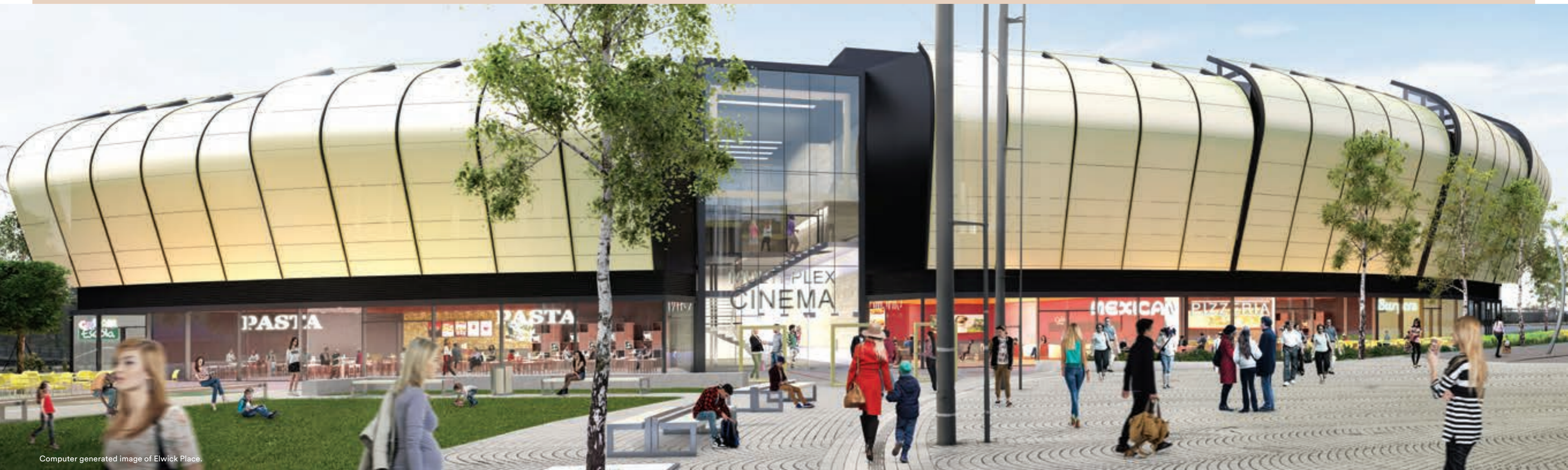
Computer generated image of Elwick Place.