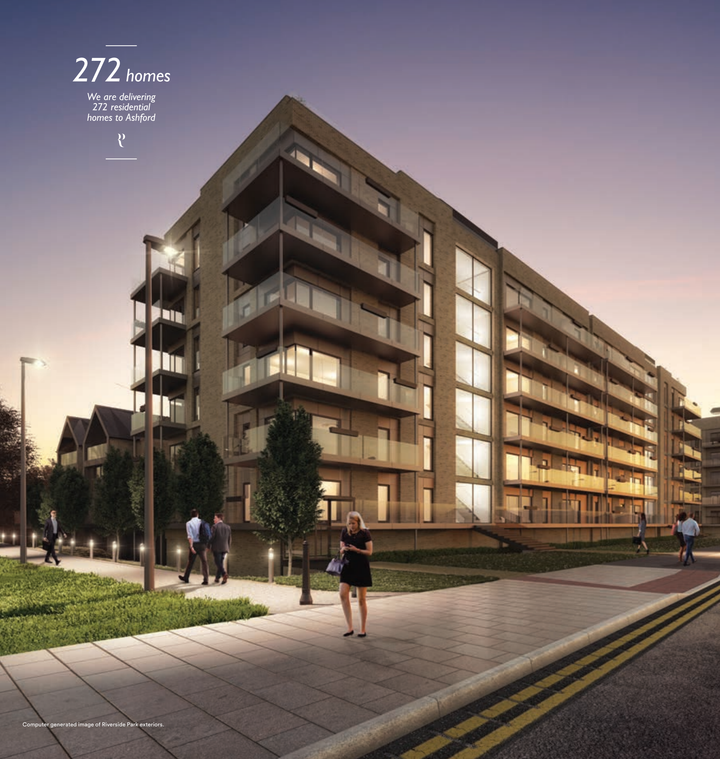
Computer generated image of Riverside Park exteriors.