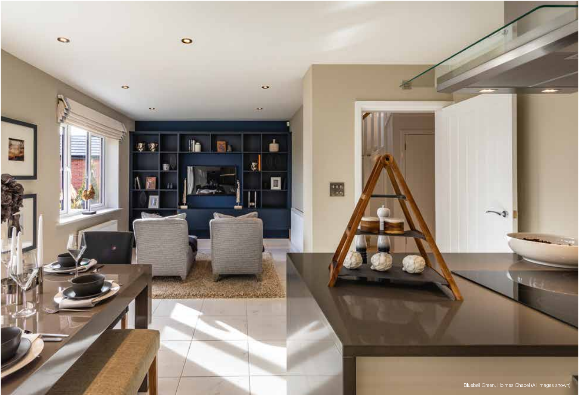
Bluebell Green, Holmes Chapel (All images shown)

Once reserved you will also be able to take advantage of our 'your choice' service which allows you to choose additional fixtures and fittings for your new home. With Bloor Homes, it's never been easier to create the home of your dreams.