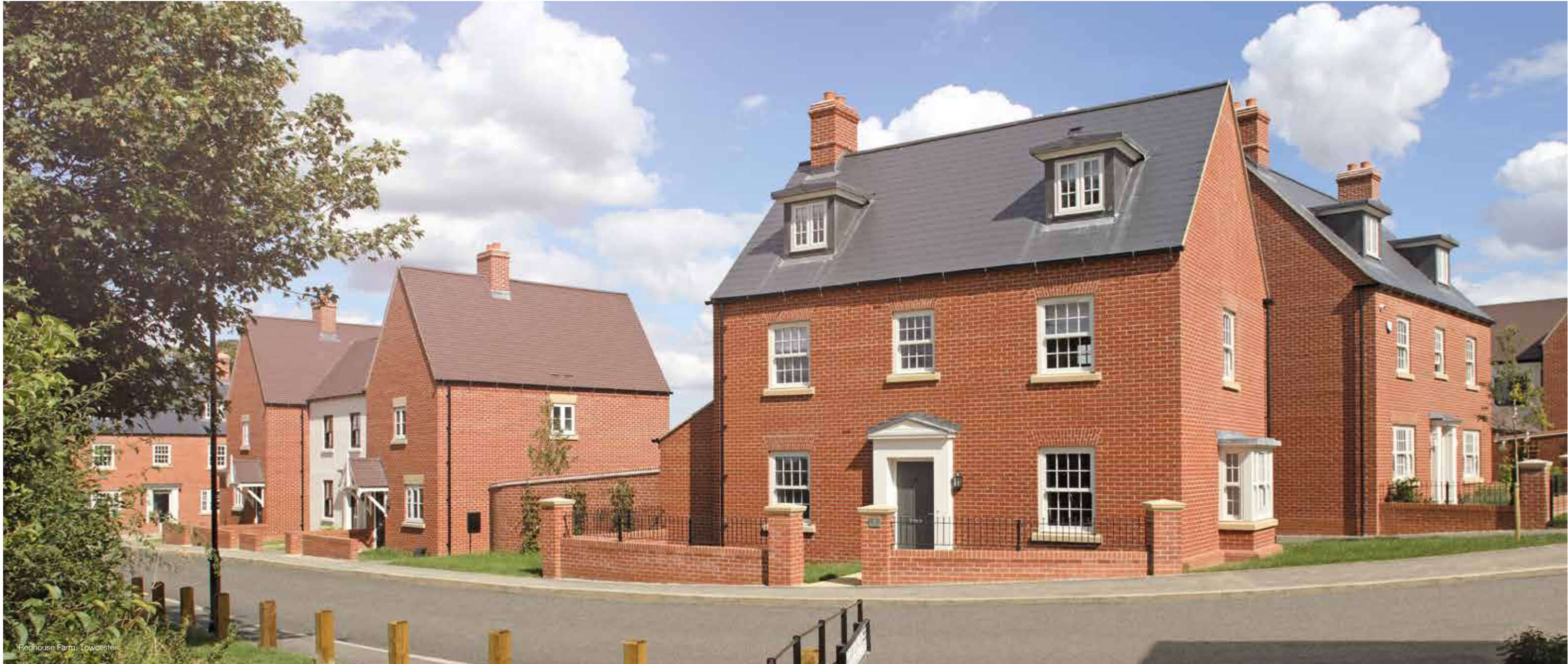
Redhouse Farm, Loughborough