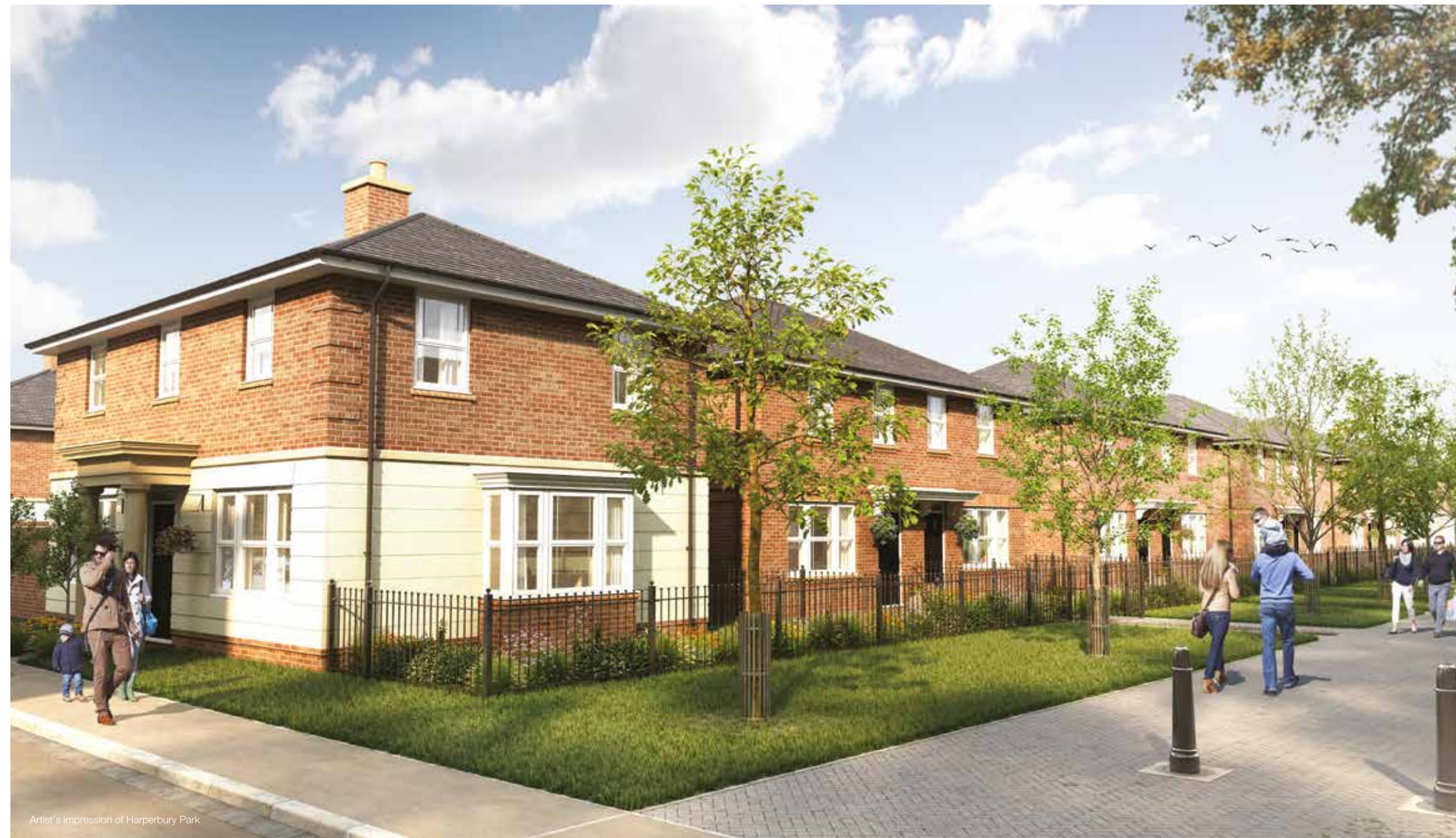
Artist's impression of Harperbury Park