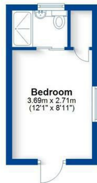
Ground Floor Approx. 55.9 sq. metres (601.8 sq. feet)