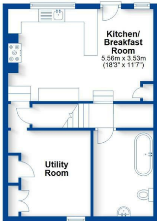
Lower Ground Floor Approx. 44.1 sq. metres (475.1 sq. feet)