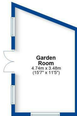
Garden Room 4.74m x 3.48m (157" x 115")

Total area: approx. 162.4 sq. metres (1748.2 sq. feet) This plan is for illustration purposes only and should not be relied upon as a statement of fact Total area does not include the Garden Room