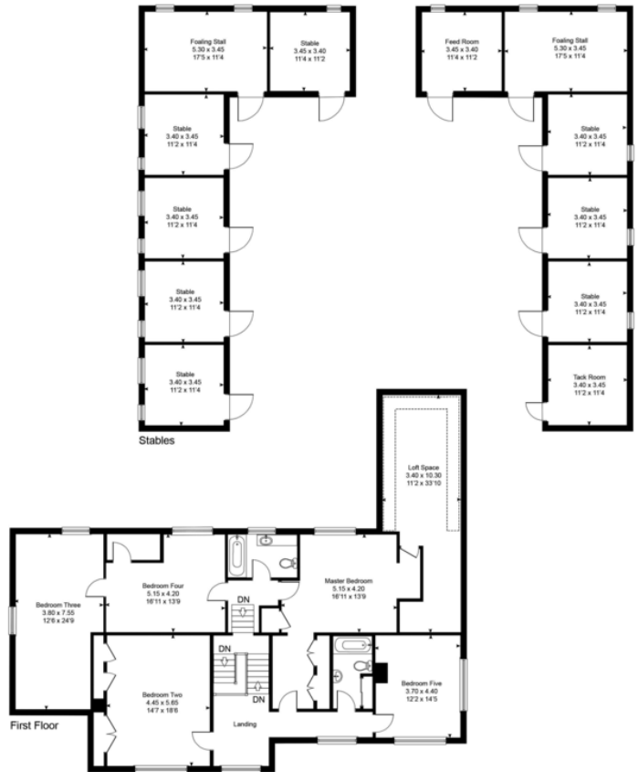
This plan is for layout guidance only. Not drawn to scale unless stated. Windows, door openings and all measurements are approximate. Whilst every care is taken in the preparation of this plan, please check all dimensions, shapes & compass bearings before making any decisions reliant upon them.