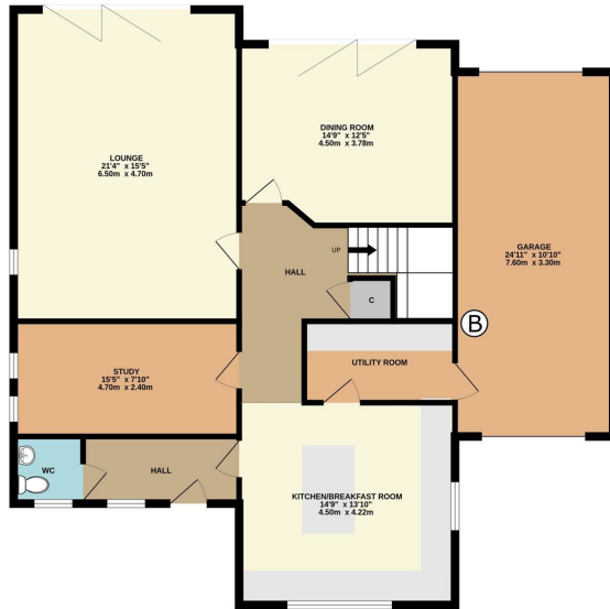
1ST FLOOR 1087 sq.ft. (101.0 sq.m.) approx.