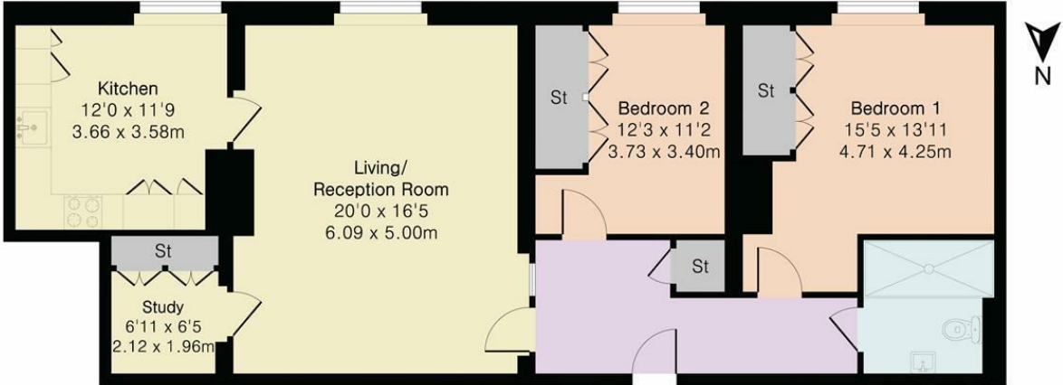
Ground Floor Flat