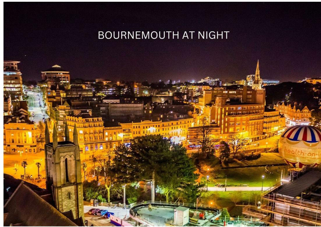
BOURNEMOUTH AT NIGHT