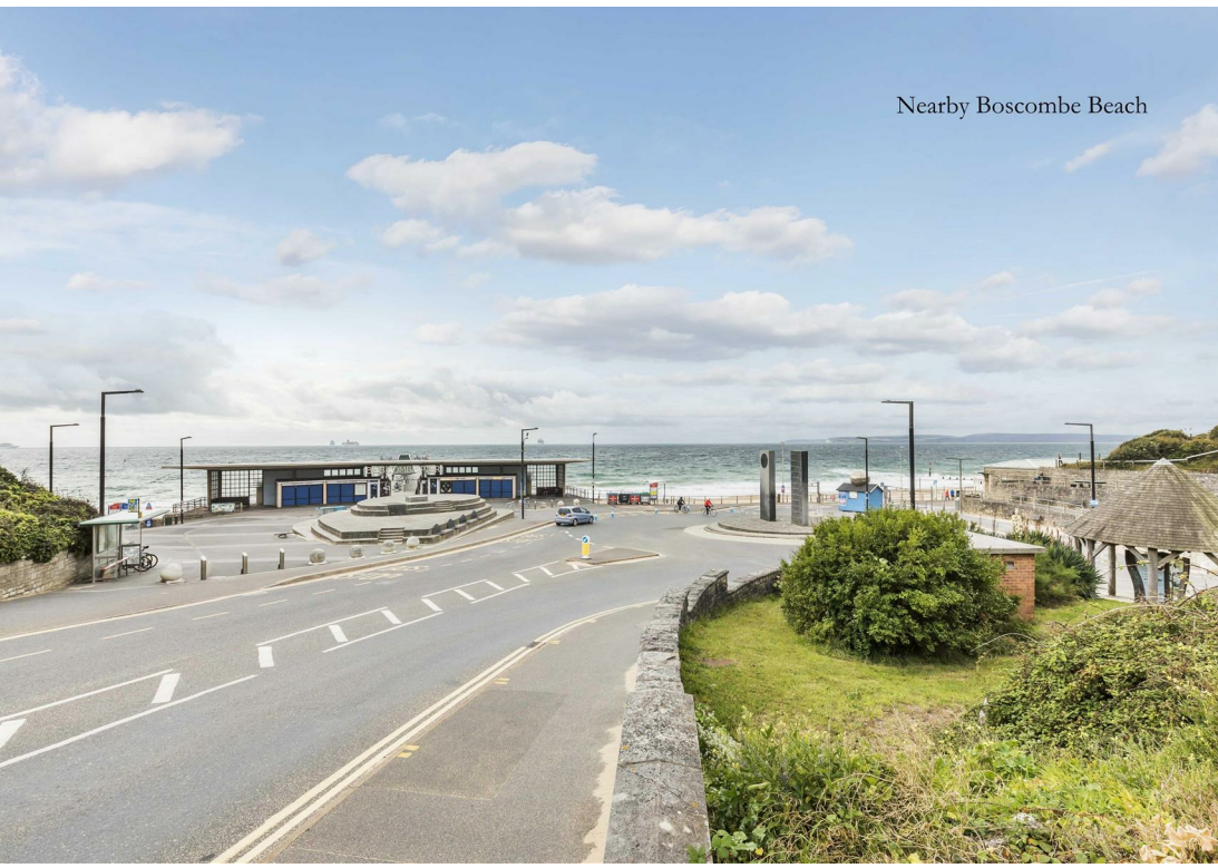
Nearby Boscombe Beach