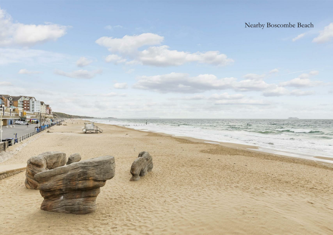
Nearby Boscombe Beach