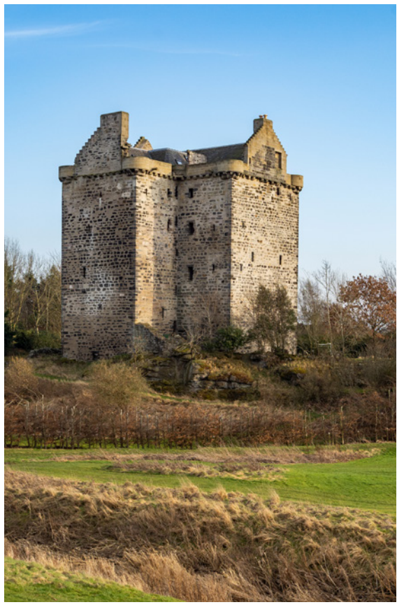
Close proximity to exciting Edinburgh, excellent transport connections and fantastic local amenities, Winchburgh Grange is situated in an ideal location, surrounded by acres of beautiful countryside.