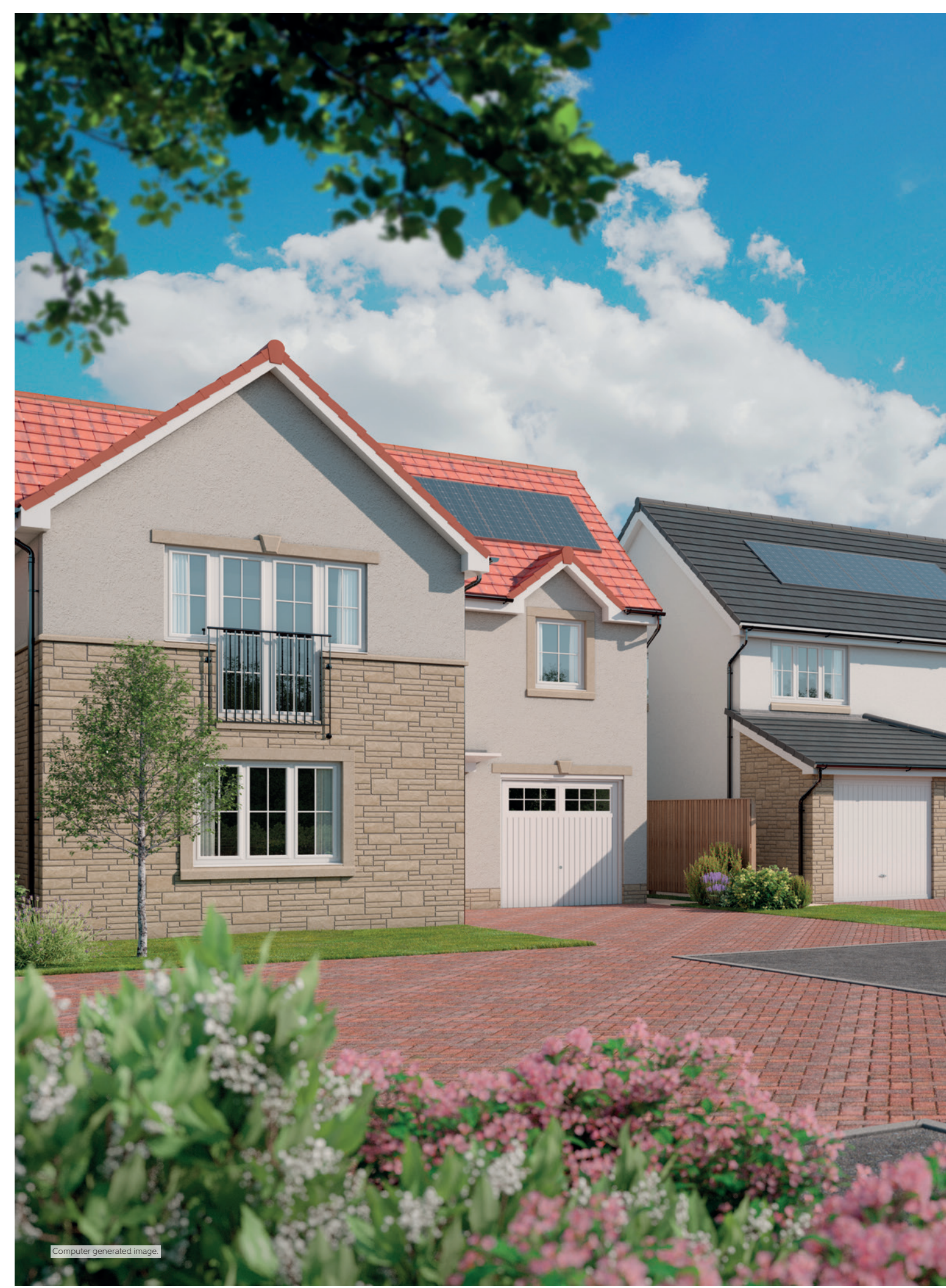
Please note Photo Voltaic (solar) panels shown above are indicative only. The location and number of panels are dependent on plot orientation. Please see Sales Advisor for details.