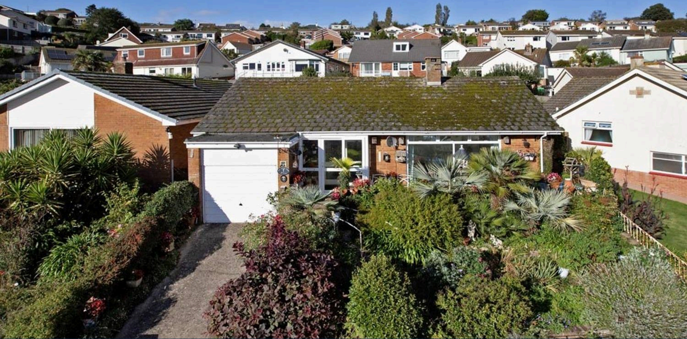
3 Meadow Rise, Dawlish £315,000