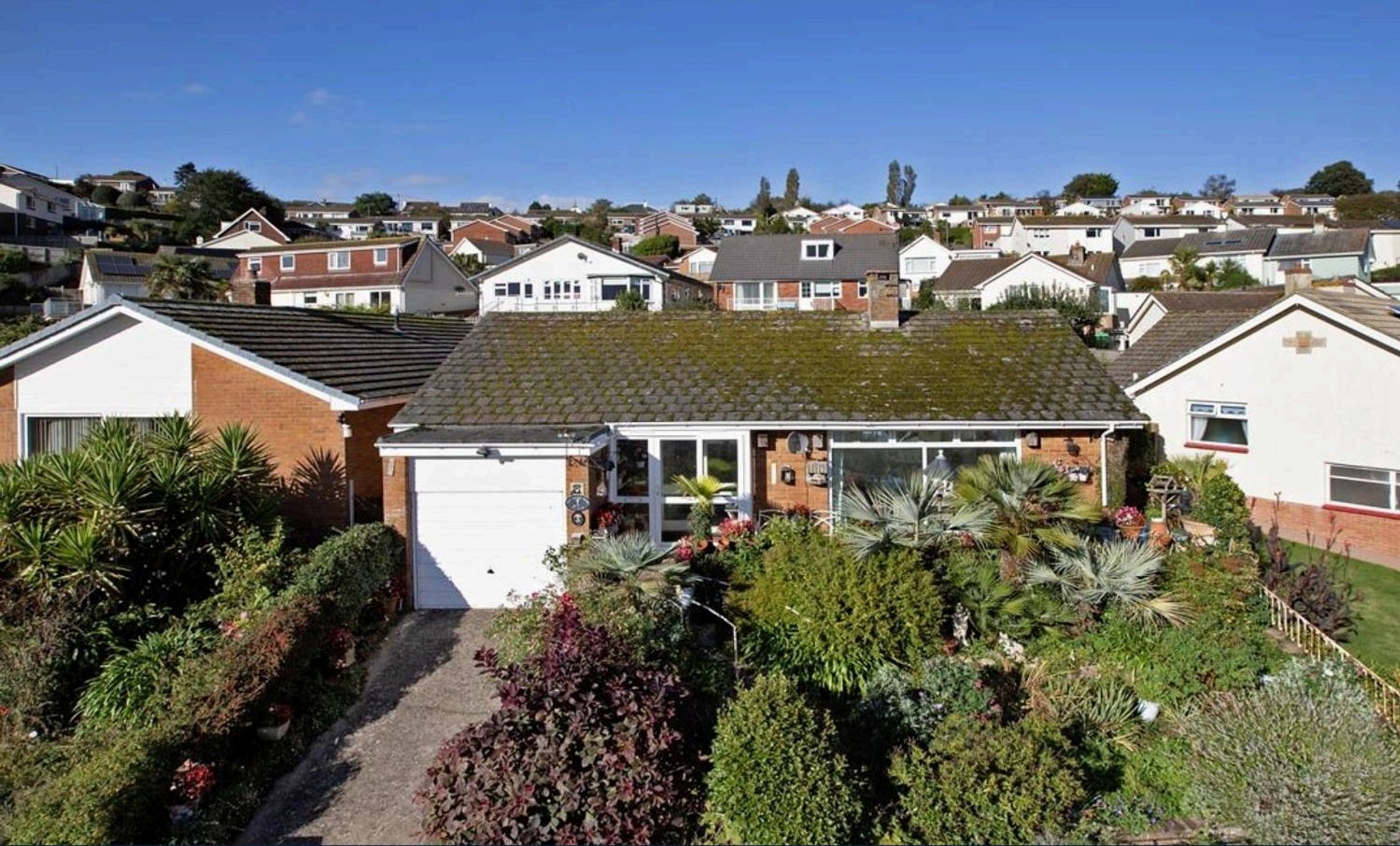
3 Meadow Rise, Dawlish £350,000