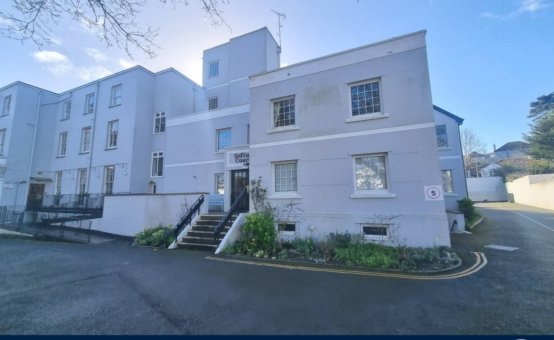
Flat 14, Sefton Court Plantation Terrace, Dawlish £63,000