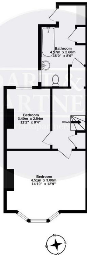
1st Floor 41.2 sq.m. (444 sq.ft.) approx.