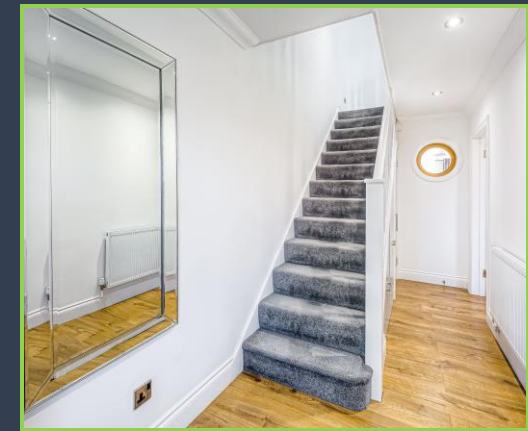
3 Bedroom Mid Terraced House £325,000 Freehold