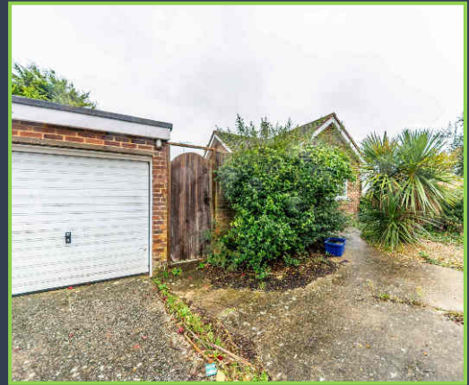
2 Bedroom Detached Bungalow £350,000 Freehold