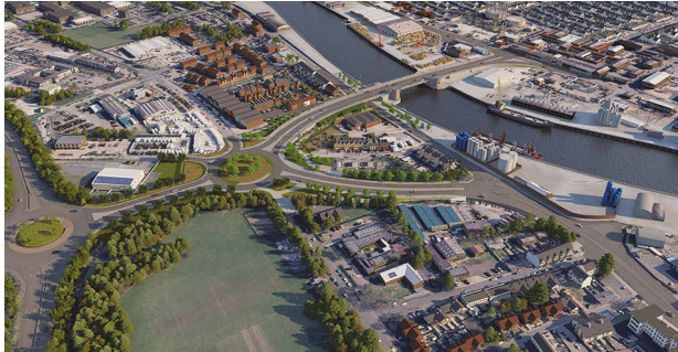
CGI of proposed third river crossing.