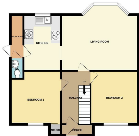
GROUND FLOOR 666 sq.ft. (61.9 sq.m.) approx.