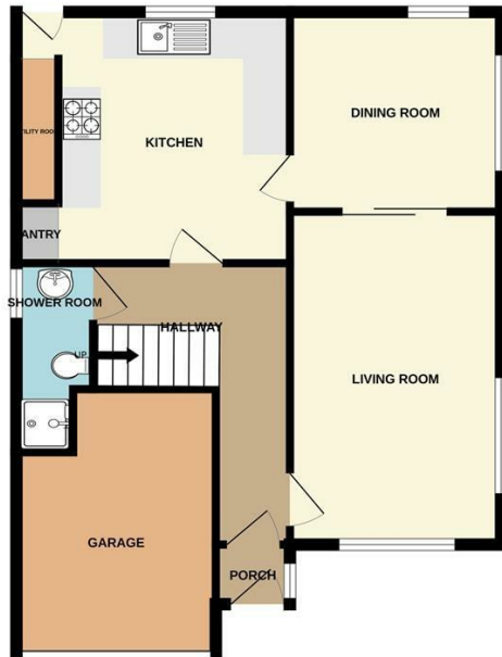
GROUND FLOOR 636 sq.ft. (59.1 sq.m.) approx.