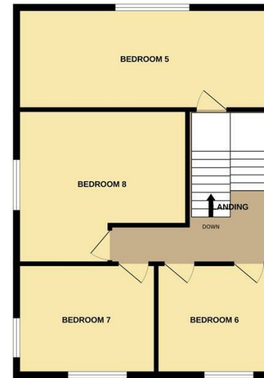
2ND FLOOR 665 sq.ft. (61.8 sq.m.) approx.