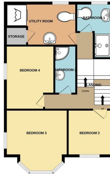
1ST FLOOR 690 sq.ft. (64.1 sq.m.) approx.