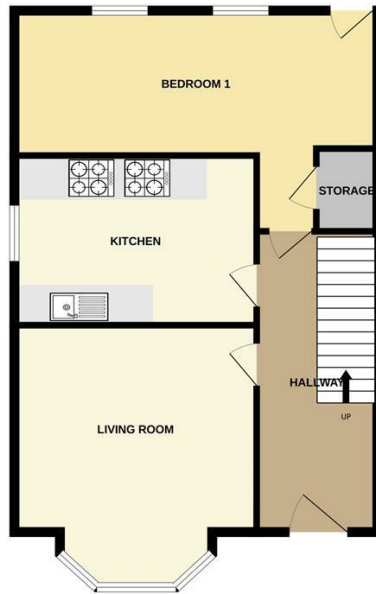
GROUND FLOOR 690 sq.ft. (64.1 sq.m.) approx.