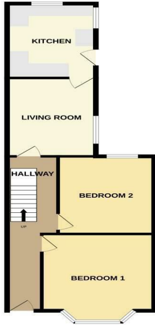
GROUND FLOOR 608 sq.ft. (56.5 sq.m.) approx.