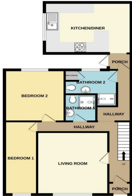
GROUND FLOOR 801 sq.ft. (74.4 sq.m.) approx.