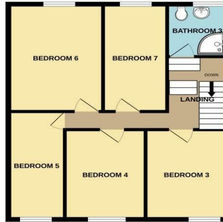
1ST FLOOR 614 sq.ft. (57.1 sq.m.) approx.