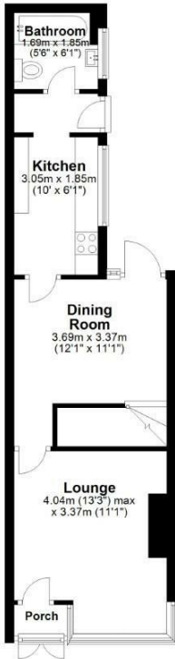
Ground Floor Approx. 37.3 sq. metres (402.0 sq. feet)