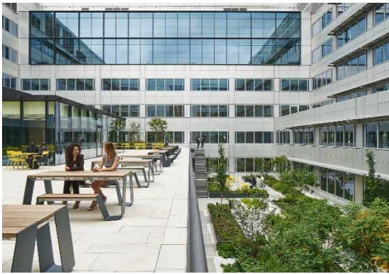
Communal Terrace and Cafe