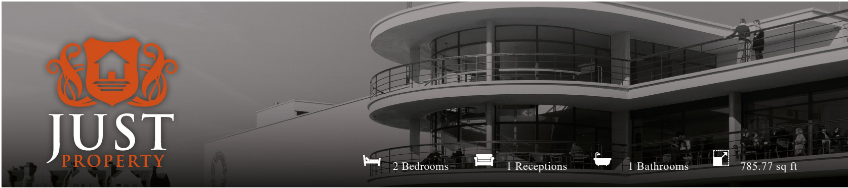
Flat 3, 22 Hastings Road, Bexhill-On-Sea, TN40 2HH