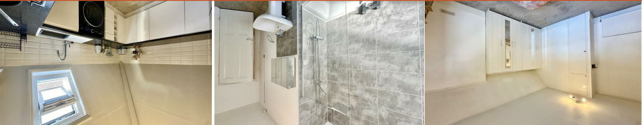
Flat 3, 22 Hastings Road, Bexhill-On-Sea, TN40 2HH