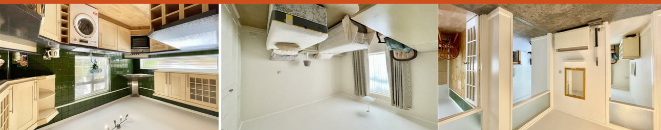
Flat 1 Garden Court Hastings Road, Bexhill-On-Sea, TN40 2HL