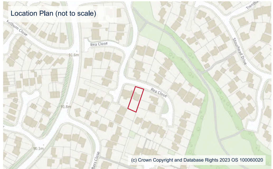
Location Plan (not to scale)