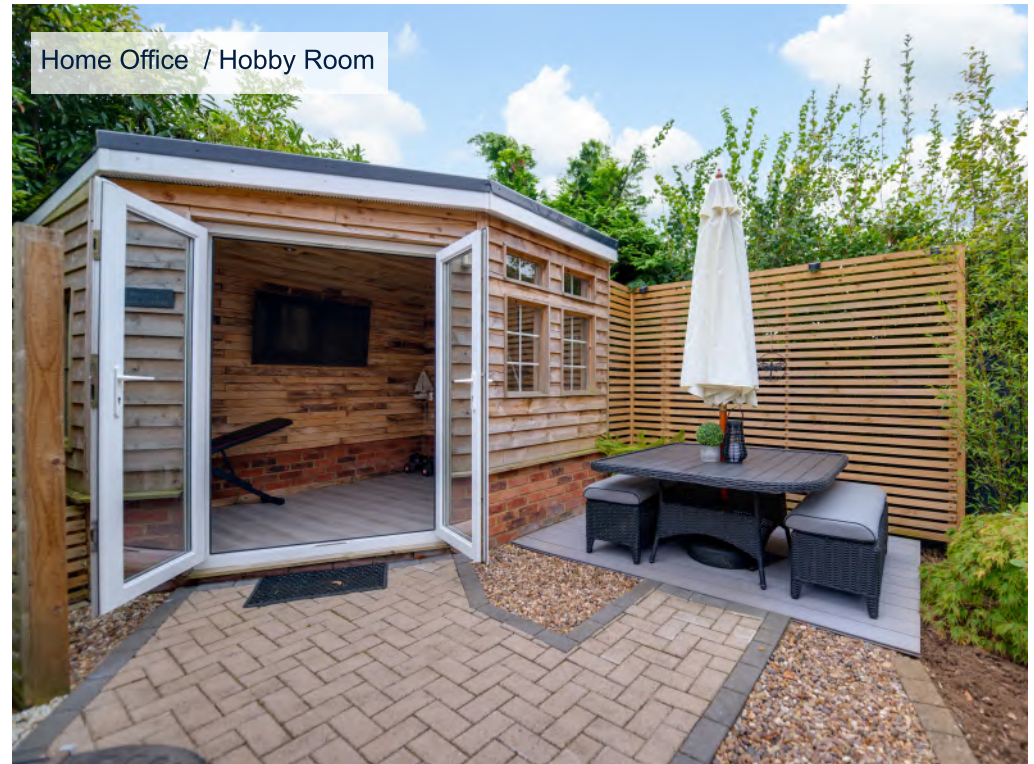
Home Office / Hobby Room

Please note that these particulars are subject to the approval of the property owner. If there is any particular point upon which you would like further clarification or verification, please let us know as soon as possible. Whilst every care has been taken with the preparation of these particulars complete accuracy cannot be guaranteed and they do not constitute a contract or part of one. Any measurements given within the particulars are approximate and photographs are provided for general information only. Any plans provided are for illustrative purposes only and are not to scale. In all cases, prospective purchasers should verify matters for themselves by way of independent inspection and enquiries. David Cosby Chartered Surveyors have not conducted a survey of the premises, nor have we tested services, appliances, equipment, or fittings within the property. On acceptance of an offer, prospective purchasers will need to provide identification and proof of funds in compliance with Anti-Money Laundering legislation.