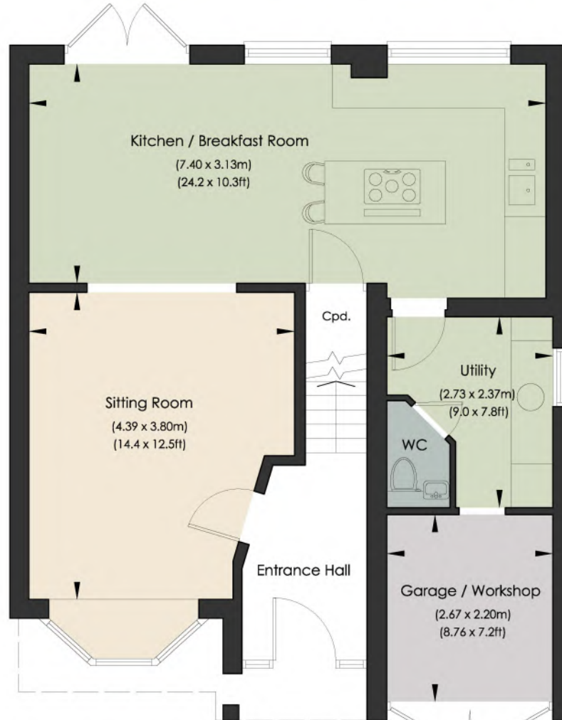
GROUND FLOOR GIA = 62 sqm (667 sqft)

This plan is for layout guidance only. It has been drawn in accordance with RICS guidelines but is not to scale unless stated. Windows & door openings are approximate. Furniture is illustrative only. Dashed lines (if any) indicate restricted head height. Whilst every care is taken in the preparation of this plan, please check all dimensions, shapes & compass bearings before making any decisions reliant upon them.