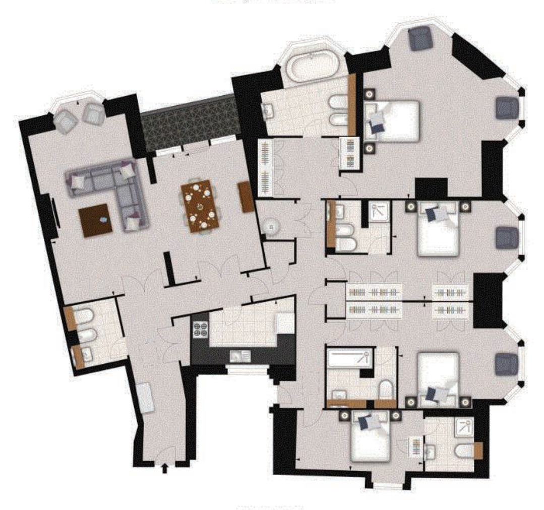
Illustration For Identification Only, Not to Scale All Calculations include Any/All Areas Under 1.5m Head Height. * As Defined by RICS - Code of Measuring Practice

APPROX, GROSS INTERNAL AREA * 2135 Ft 2 - 198.34 M 2