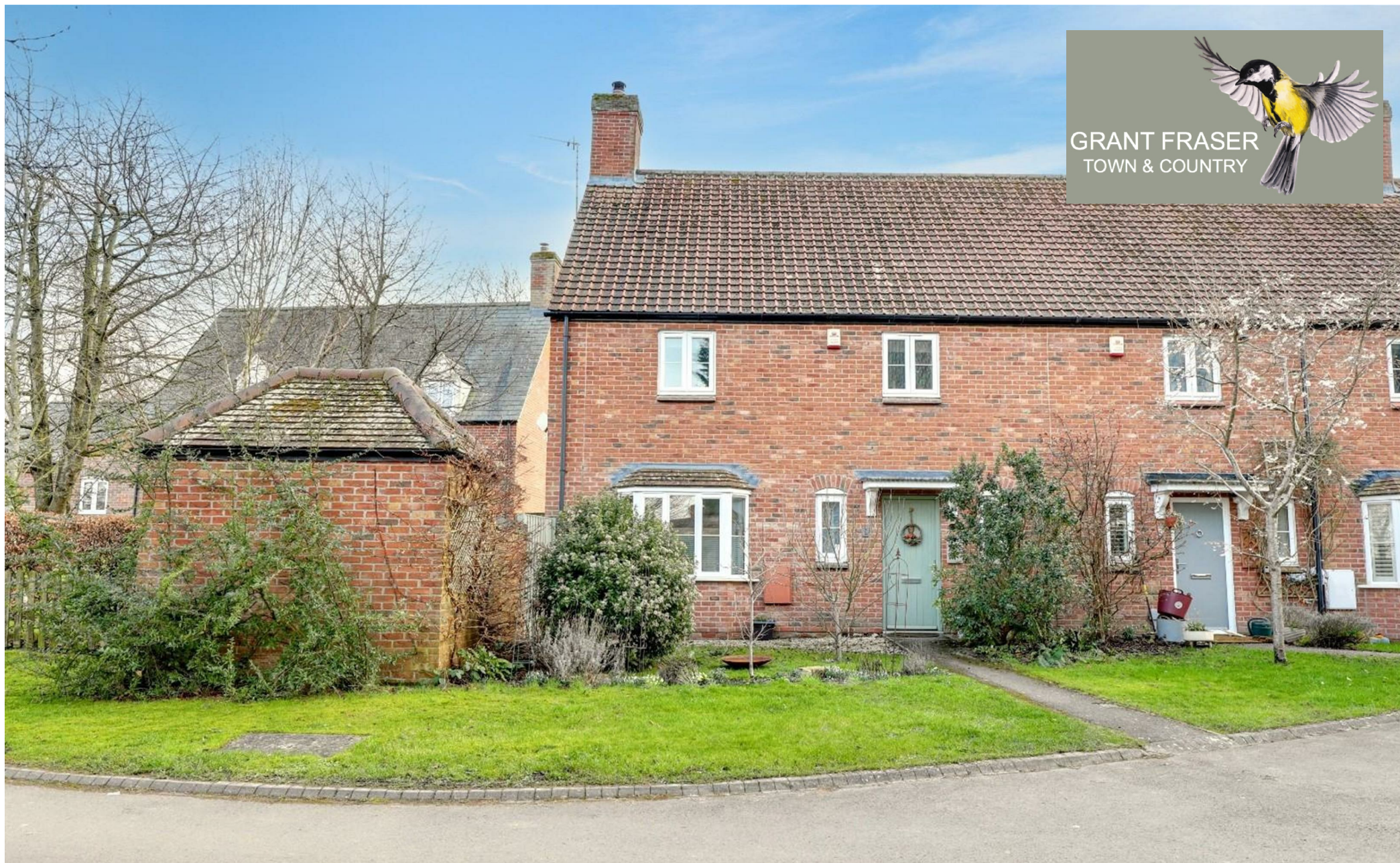
2 Povey Place, Bishopstone, Wiltshire, SN6 8PE Guide price £450,000