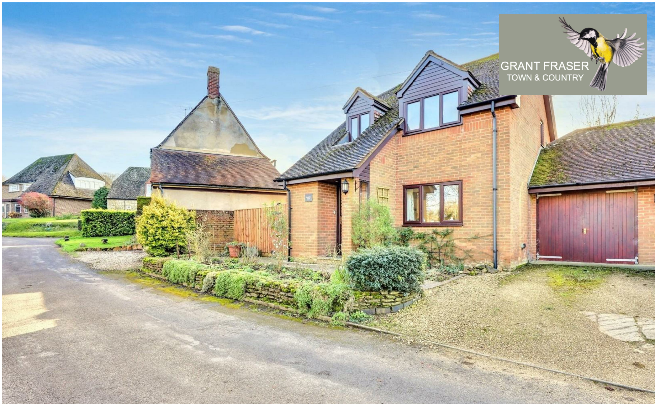
Manor View, Berrycroft, Ashbury, Oxfordshire, SN6 8LX Guide price £375,000