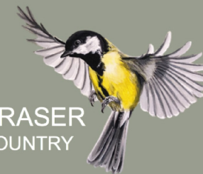
5 Malthouse Close, Ashbury, Oxfordshire, SN6 8PB Guide price £365,000