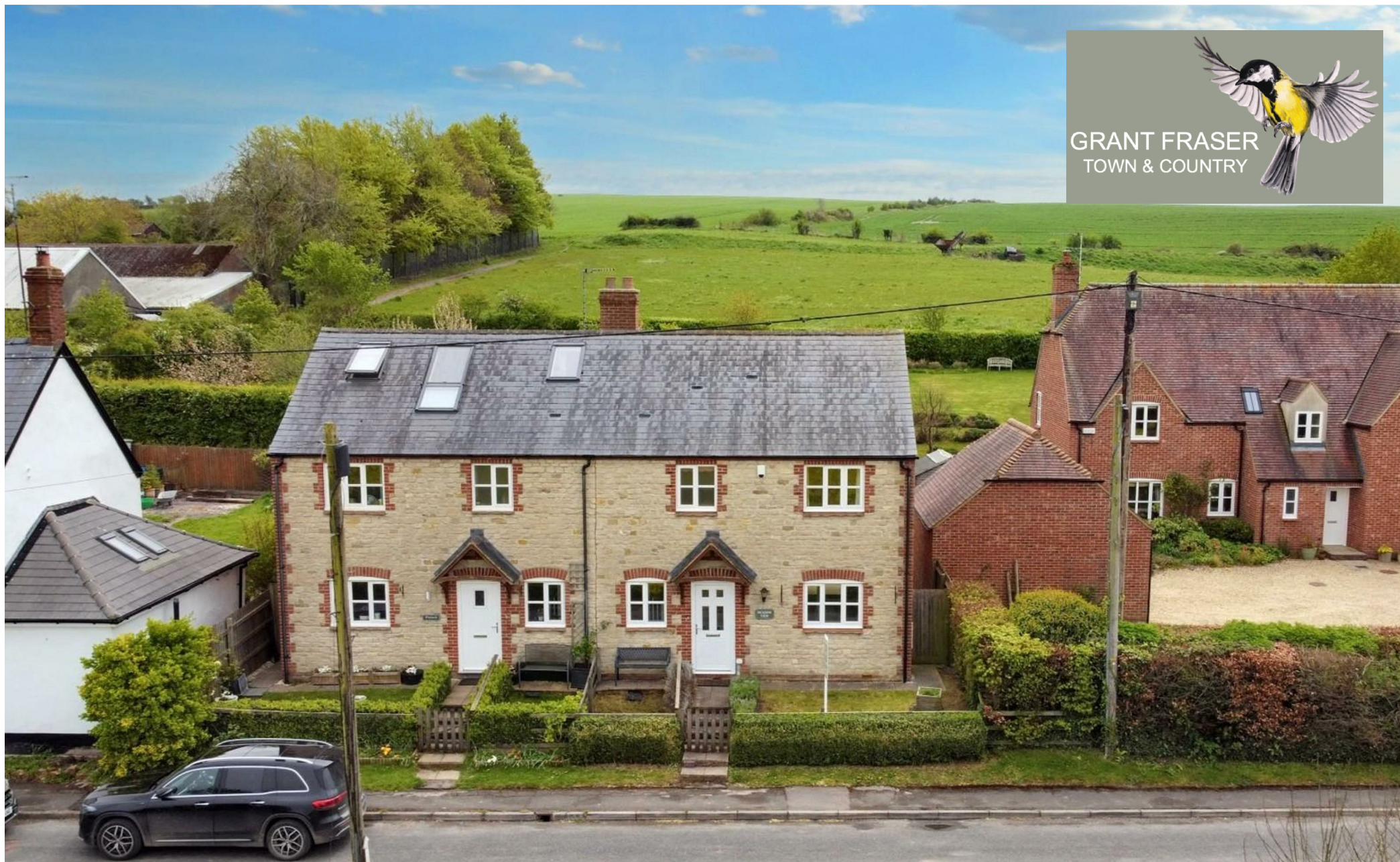
Meadow View, 13 Idstone Road, Ashbury, Oxfordshire, SN6 8LP Guide price £425,000