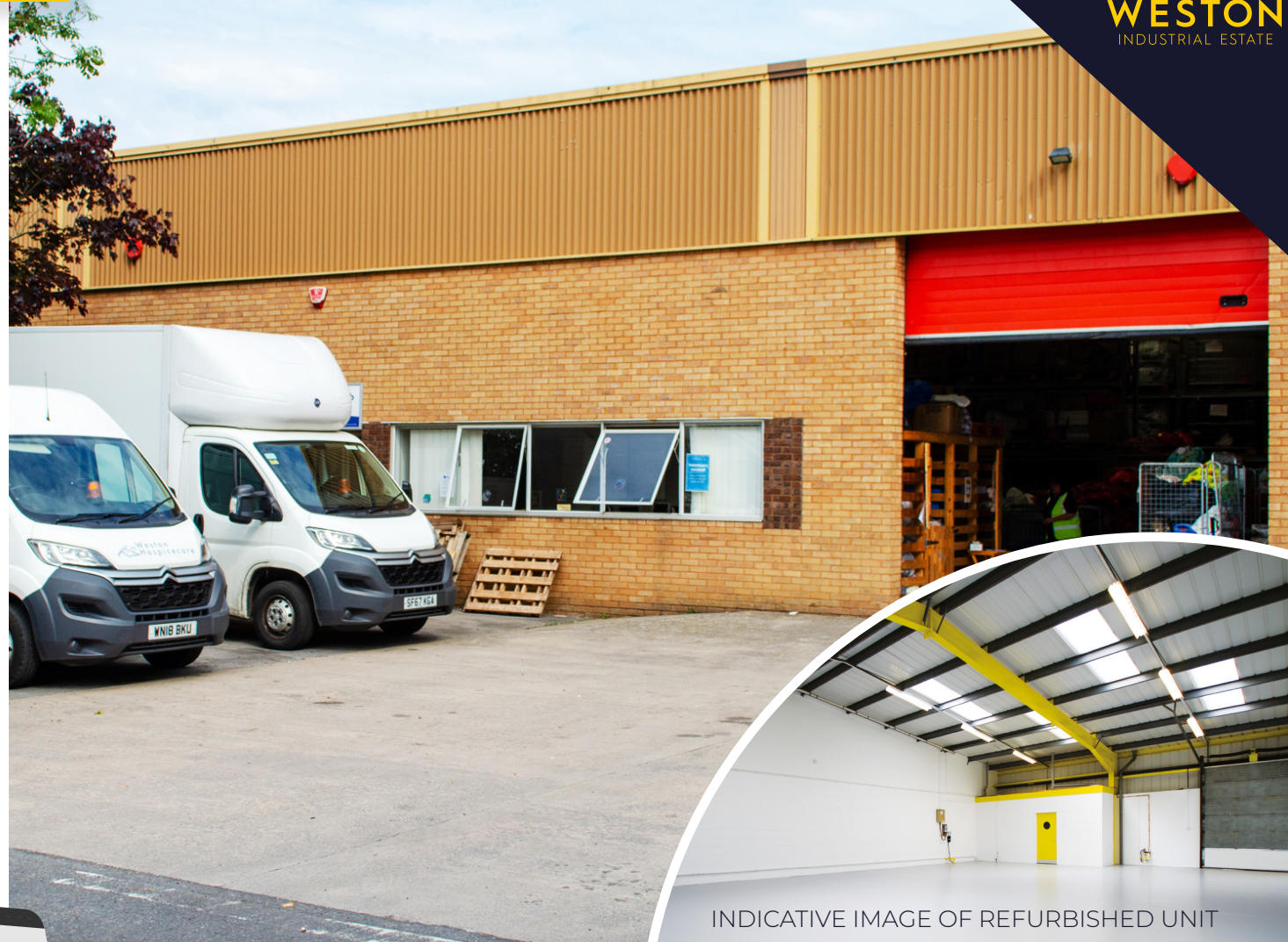
INDICATIVE IMAGE OF REFURBISHED UNIT