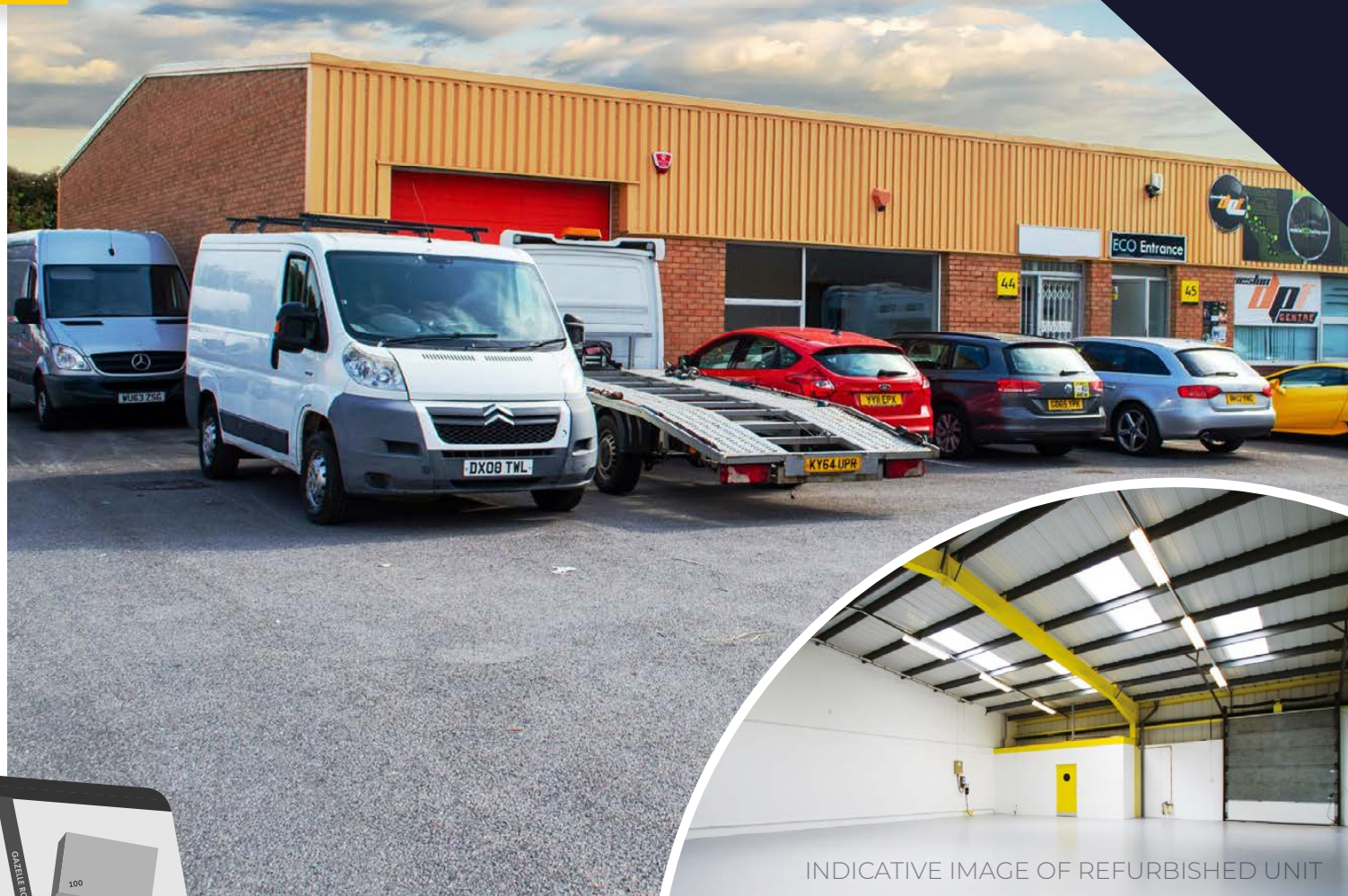
INDICATIVE IMAGE OF REFURBISHED UNIT