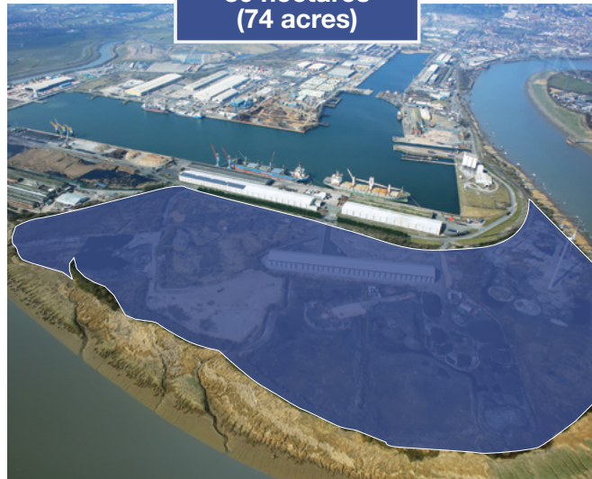
Atlantic Site 30 hectares (74 acres)