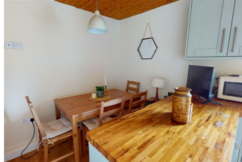
15 Upper Lane, Northowram, Halifax, Yorkshire, HX3 7EE Offers In The Region Of £170,000

HAMILTON BOWER are pleased to offer for sale this TWO BEDROOM COTTAGE located in the heart of Northowram, Halifax. With a large master bedroom, open-plan dining kitchen, and it's prime village location, we expect this property to be popular with a wide range of prospective buyers. Internally comprising; entrance hall, lounge, dining kitchen, cellar, primary bedroom and a further double, bathroom and loft. Externally the property has a low-maintenance gated garden to the front, and parking is accessible nearby. Benefitting from gas central heating and double glazing throughout, the property is available to view immediately.