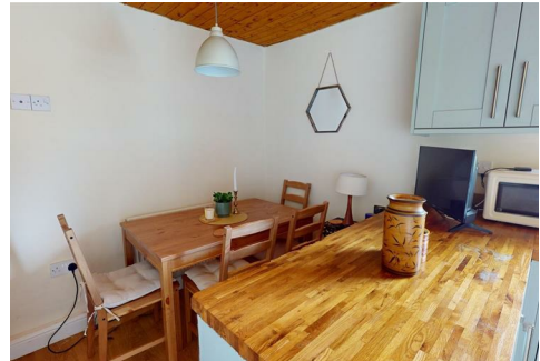
15 Upper Lane, Northowram, Halifax, Yorkshire, HX3 7EE Asking Price £165,000

HAMILTON BOWER are pleased to offer for sale this TWO BEDROOM COTTAGE located in the heart of Northowram, Halifax. With a large master bedroom, open-plan dining kitchen, and it's prime village location, we expect this property to be popular with a wide range of prospective buyers. Internally comprising; entrance hall, lounge, dining kitchen, cellar, primary bedroom and a further double, bathroom and loft. Externally the property has a low-maintenance gated garden to the front, and parking is accessible nearby. Benefitting from gas central heating and double glazing throughout, the property is available to view immediately.