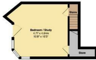
Lower Ground Floor Area: 27.3 m 2 ... 294 ft 2