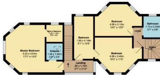
First Floor Area: 73.6 m 2 ... 793 ft 2

Total Area: 193.6 m 2 ... 2084 ft 2 (excluding balcony)