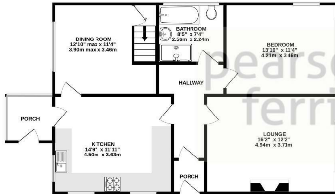
GROUND FLOOR 852 sq.ft. (79.1 sq.m.) approx.