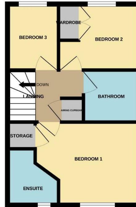
1ST FLOOR 358 sq.ft. (33.3 sq.m.) approx.